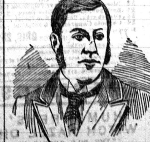
SIR JOHN THOMPSON.

Sir John Thompson's death occurred at 1:45 p. m. His attack lasted fifteen minutes, he having been stricken at 1:30. After attending the privy council meeting Sir John adjourned with the ministers and others to luncheon. Shortly after this he became suddenly ill and expired immediately.