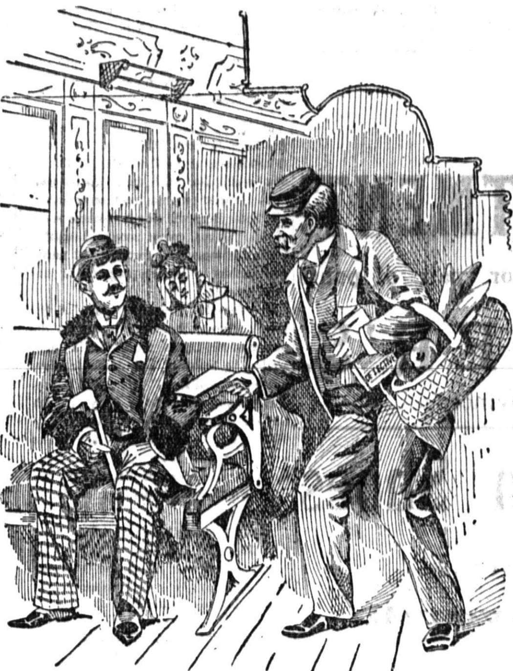
THE YOUNG MAN BOUGHT THE BOOK.

and discouraged expression of his countenance it was evident that trade was not very lively. The train boy in this case, as in most cases, was a man in years, but still short enough in stature to be called a boy without absurdity; one of those unhealthy and weak-looking mortals who are uninteresting to anyone except their own near kin. The train boy seated himself in an unoccupied corner next to the group of drummers, and taking from his pocket a meager handful of small coins began to count them over. He seemed to derive little comfort from this occupation, for he soon replaced the money in his pocket with an audible sigh. I began to feel a languid compassion for the fellow—not, I confess, the sort to do me any credit—for my pity was not entirely free from a feeling of contempt, a spurious pity, barren of any result; a sort of speculative pity, leading me out into meditations on the diversities and proportionate responsibilities of humanity. The wretched fellow made me feel uncomfortable. What right had the authorities to torment the traveling public by introducing such a factor into their service? A train boy is always a nuisance at his best, with his impudent and constant annoyance, his utter lack of delicacy, his trespass on time and patience, his presumption and intrusion on our privacy. And by what law of equity